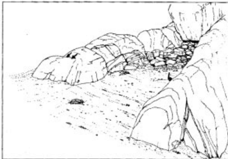
Figure 3-2 A drawing of the conspicuous underwater scenery to aid the relocation of a sample station h

Relocation of fixed sites can be very difficult, especially underwater in poor visibility or with few conspicuous features to act as navigation aids. Global Positioning Systems (GPS) now offer the possibility of accurate site relocation to \pm 15\text{m} using a standard receiver, or \pm 1\text{m} if combined with an additional receiver to gather a correction signal - differential GPS (dGPS) 5 . If necessary, there are specialised GPS systems available, called Real Time Kinematic (RTK) GPS, which can achieve centimetre level accuracy, offering the possibility of returning to a very precise location. Without GPS technology, it is usual to use a map to locate the approximate position of a sampling station on intertidal reefs. Maps should be supplemented by photographs and/or diagrams of characteristic topographical features to find the precise location of a site marker. For subtidal sites, the approximate position can be located using conspicuous land features, preferably lined up to create transits. Photographs and/or diagrams should be used underwater to find the precise sample location although poor visibility creates severe problems (Figure 3-2).